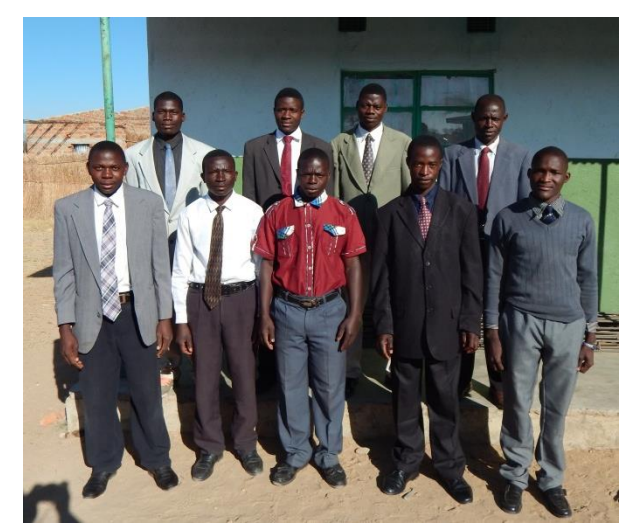
Students at Siamafumba School of Biblical Studies

On Monday August the 10<sup>th</sup> we started our schedule at Zambia School of Biblical Studies in Livingstone. We were speaking in chapel each day at 8 am and teaching for 6 hours each day on the Parables of Jesus. On Thursday August 13<sup>th</sup> we were back to the bush for another Gospel meeting, this time at the Misika congregation. We had over 1,000 present for this meeting also. There were 25 baptisms and 42 restored at the Misika meeting. During the Misika meeting we had a graduation for 2 of our ICOTB students receiving their BA in Bible. On Sunday night August 16<sup>th</sup> we returned back to Livingstone.