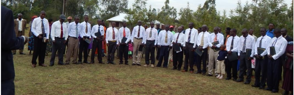
The graduates at Kalimindi, Kenya

On Sunday September 6<sup>th</sup> after the worship service we had another graduation. There were 6 men receiving their BA degree in Bible from ICOTB and 12 men were graduating from Kalimindi School of Preaching.