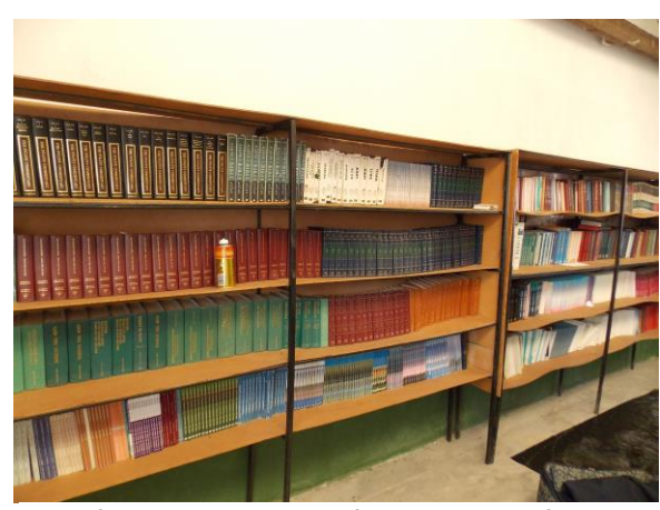
Part of the library at Siamafumba School of Biblical Studies. All of these books have been provided by donations to IBTM.