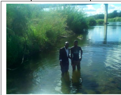
4 baptized Mozambique