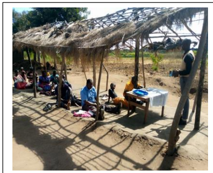
Malawi new building coming