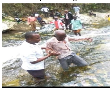
5 baptized Congo