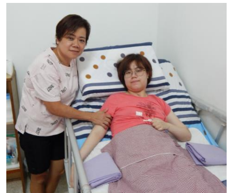
Former Buddhists who are now Christians

We had a good trip working with 5 different congregations. Our goal is to encourage and strengthen the brethren there. These brethren are a great source of encouragement to us also we appreciate them so much and the good work they are doing under difficult circumstances. While we were there 3 precious souls they had been studying with were baptized into Christ. A few years back some of you may remember a report in our newsletter from a Malaysia trip about a young lady about age 19 who was in an auto accident and was paralyzed. She was a Buddhist living with her mother and grandmother. Many of the brethren there studied with this young lady and about 3 years ago while we were there she was baptized into Christ. The brethren there continued to visit and study with her mother and while we were there this year the mother who also was a Buddhist was baptized into Christ. Our brethren in Malaysia are very evangelistic. They make mission trips to many other places in the world and have helped establish other congregations in different areas. Several of these congregations have helped our work by giving funds to purchase Bibles in Africa. We appreciate their concern for the lost and their efforts to help with these Bibles.