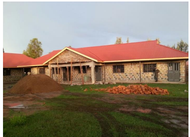
Last month we showed you the Tom Music School of Preaching under construction in Kalamindi, Kenya. Building has continued and now it is almost finished.