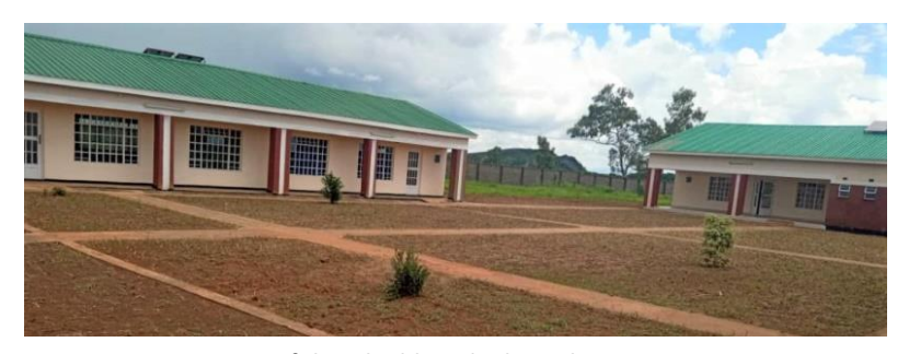
2 of the 3 buildings built in Lilongwe.

start a new congregation on property that joins the preacher school property. We hope to be able to raise funds in 2020 to build this new church building in Malawi.