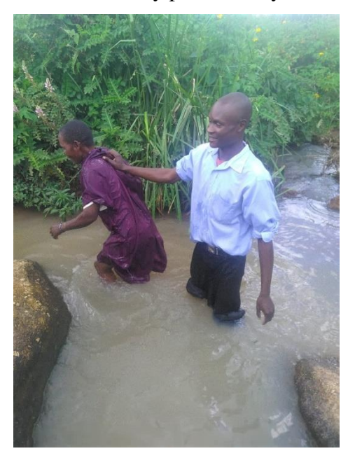
One of the almost 3,000 baptisms last year.

Greetings to you all in the name of our Lord Jesus Christ. 2019 was a very busy year for us at IBTM and a very productive year in the work for the Lord.