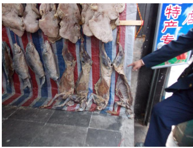
A local market, the man is pointing at salt cured dog.

I was thinking about the population of some of the cities we visited and passed through on this trip. Going over we landed in Seoul, South Korea which has 20,550,000 people. On our return we landed in Tokyo, Japan which has 32,450,000. We stayed in Shanghai, China which has around 25 million people. China has about 1.3 billion people. Perhaps no one really knows the true population of China because it is against the law to have more than one child with very large fines for having a second child. For this reason many in the rural areas have children at home but do not report the birth of the child. There are about 100 known New Testament Christians in Shanghai. It is against the law there for the Lord's Church to meet so they must meet in low profile. For obvious reasons we will not go into any details about the church there and who they are and where they meet. The city of Shanghai with its 25 million is about the same in population as the states of Tennessee, Kentucky, Alabama and Georgia combined living in one city. These states in the USA have a combined membership of about 340,000 Christians while Shanghai has about 100.