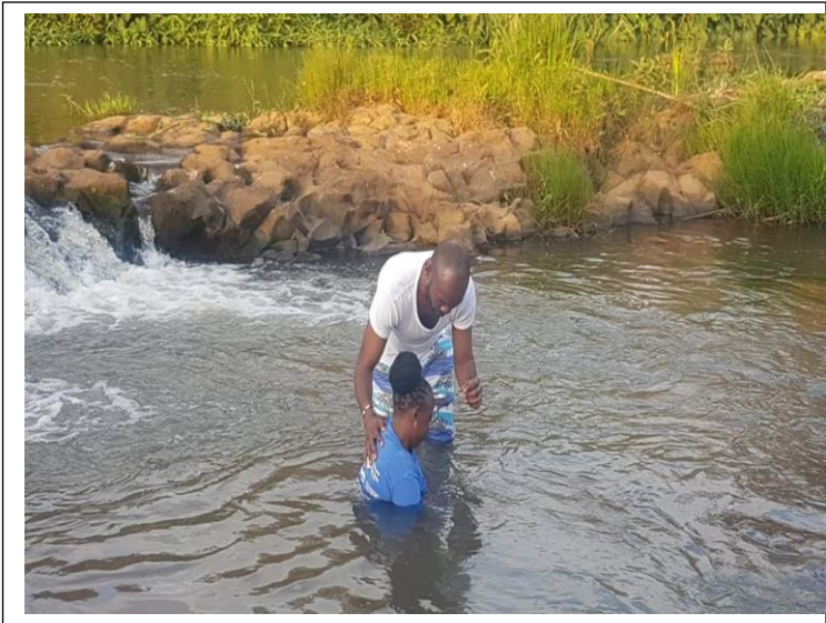
Recent baptism Gospel meeting-Kenya