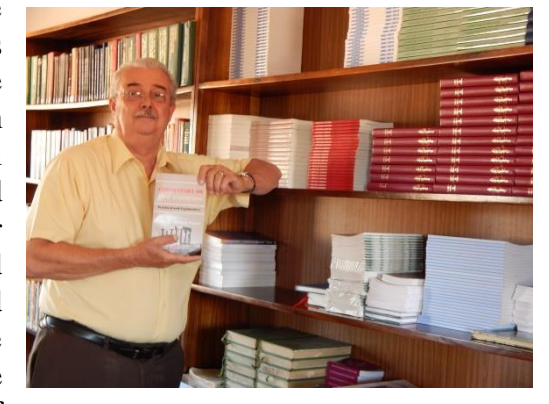
One of the 12 preaching school libraries that we send books to. The JBH Memorial Library fund also helps with this vital need.

schools. A preacher school needs to have a good library so the students can read and learn while they are there as students. Students also need many books for text books as they are taking classes at the schools. We also try to give each student a few books to take with them so they can continue to study. I hope you can see the problem we are up against! With our 12 schools currently having a combined enrollment of 152 students if we are purchasing just one text book for each of these students at a cost of $10.00 per book these books would cost $1,520.00 and about another $1,520.00 to ship them! We send Bibles and have sent over 1 million Gospel tracts to Africa. We have printed thousands of BCC courses and sent them to Africa. We have sent and carried over 3,000 pounds of Bible class materials, Much of this was for children's classes. We have printed song books in several different African languages and several thousand Bibles have been