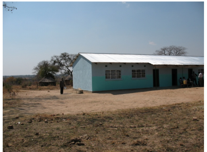
A straw hut in back ground where the preacher training school in Kaloma started out.