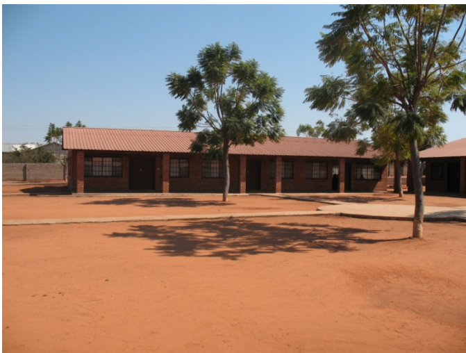
Part of the buildings at Zambia School of Biblical Studies in Livingstone, Zambia. We teach there each year while we are visiting Zambia