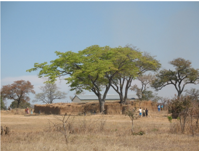
Gospel meeting at Siamafumba, near Kalomo Zambia, under the brush structure, there were over 2,000 in attendance.