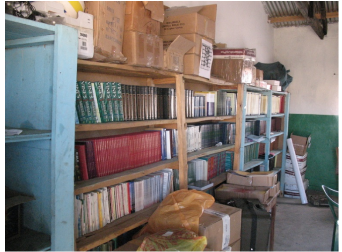
Some of the books IBTM has sent to the new preacher training school in the bush to help train faithful men to preach the gospel of Christ.