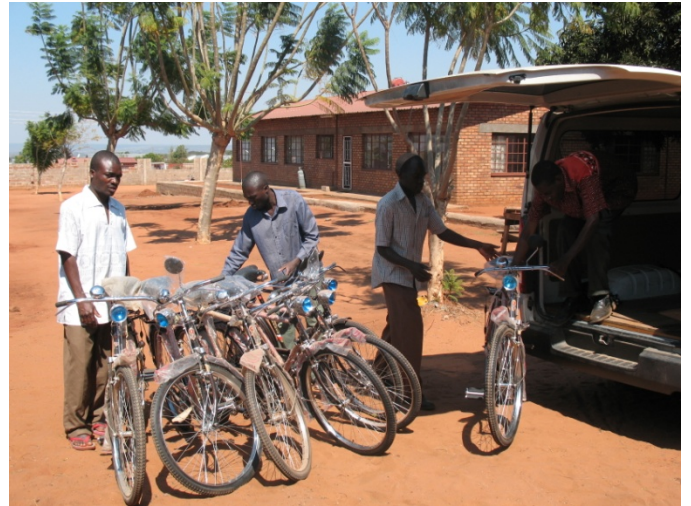
Some of the bikes purchased for gospel preachers at $100.00 each- last year we purchased over 30 bikes.