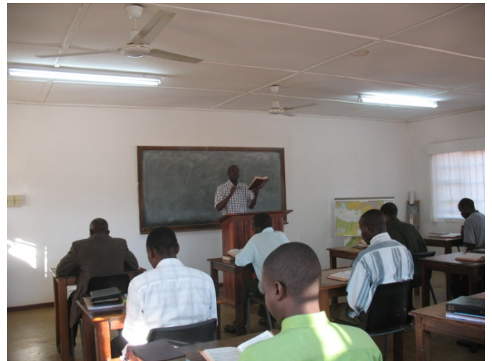
Chapel session at Zambia School of Biblical Studies in Livingstone, Zambia, they graduated 20 students in November 2009.