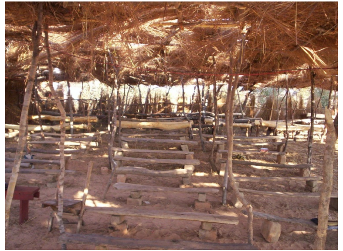
Inside the brush structure where people sit from 7:00Am to about 10:00PM listening to the preaching of God's Word.