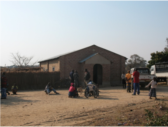
Gospel Meeting at the Misika church of Christ near Kalomo, we had 1,000 in attendance and meet outside under the brush structure.