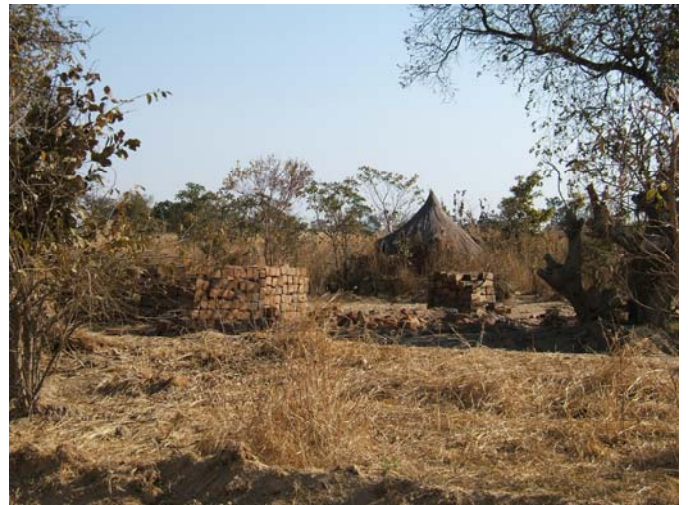
Village life in the bush.