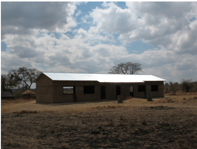
A picture of a new preacher training school in the bush near Kalomo when it was under construction.