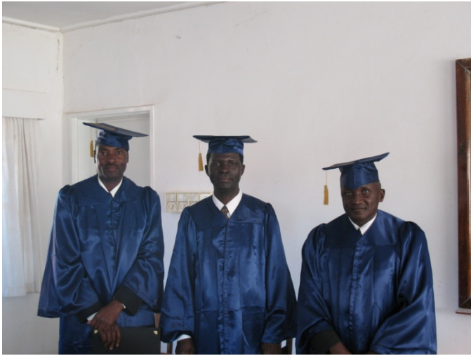
Three instructors at Zambia School of Biblical Studies who earned their MA degree in Bible last August 2009.