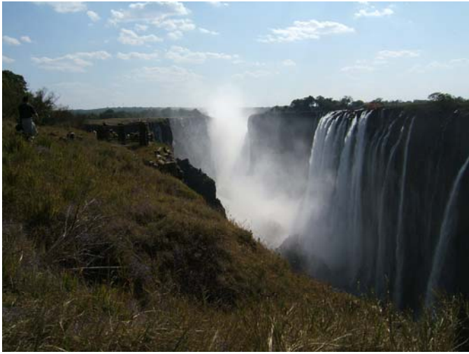
Victoria Falls near Livingstone, Zambia.