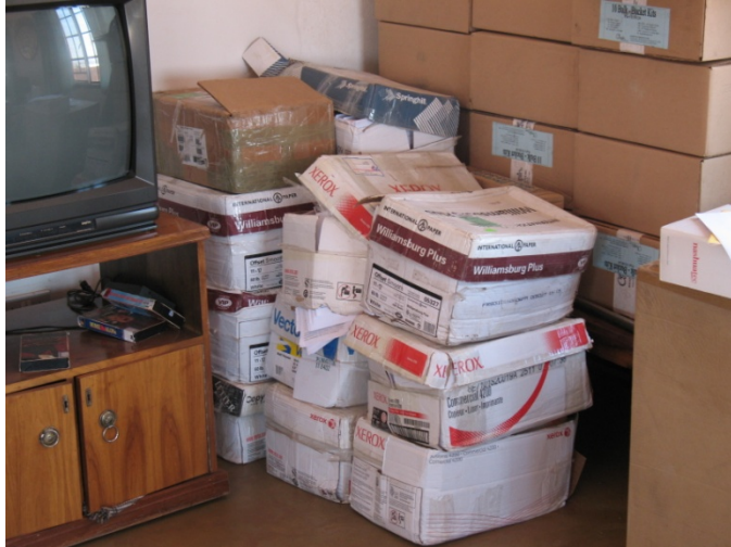
Boxes of tracts and gospel materials sent to Zambia by IBTM