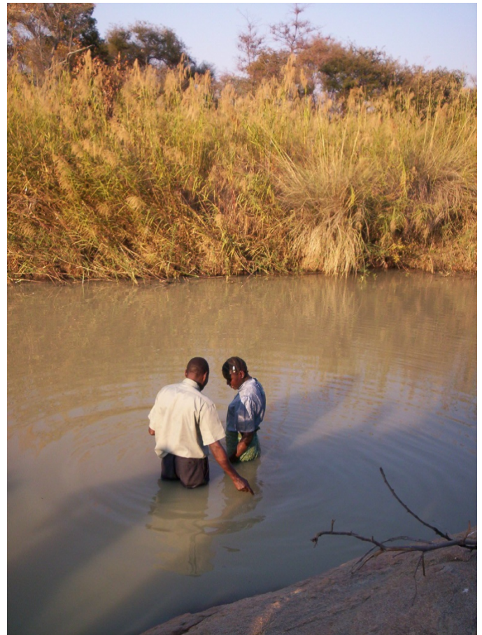
One young person being baptized into Christ for the remission of sins.