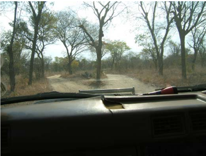
No road signs in the bush.