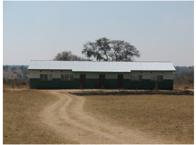
Siamafumba School of Biblical Studies building completed, built by funds donated by Christians in the USA