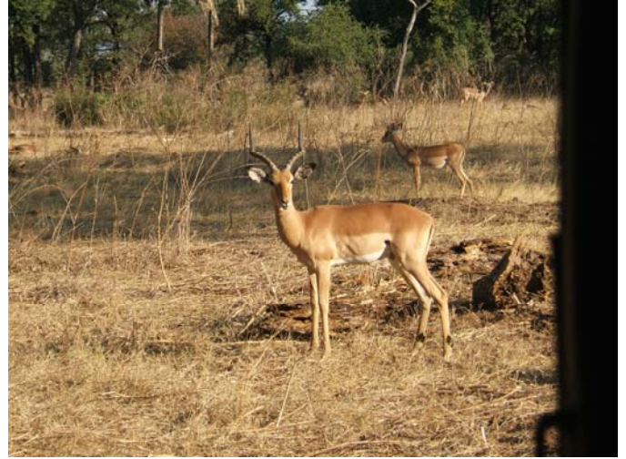
Wildlife at a game park near Victoria Falls.