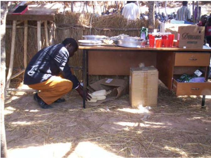
Lord's Day Worship, some who are very poor give ears of corn for their contribution