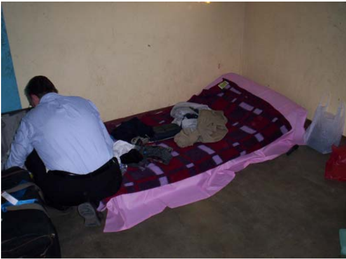
Getting ready for bed at the Siamafumba meeting.