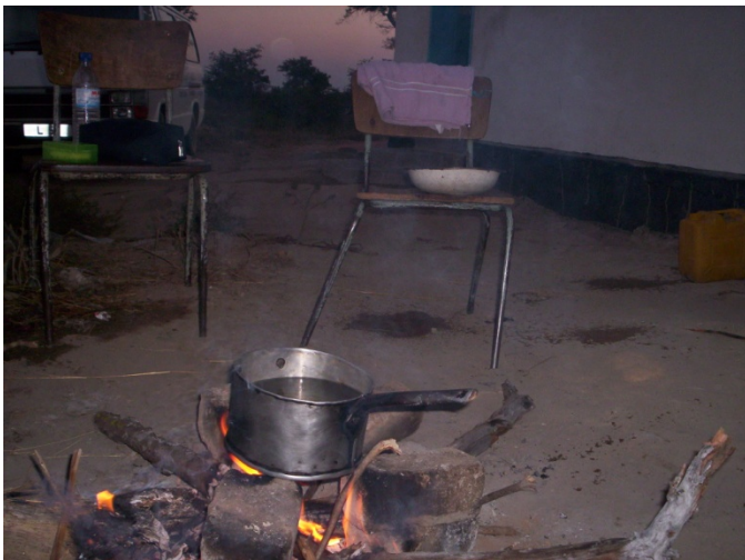
Late night tea before bed in the bush.