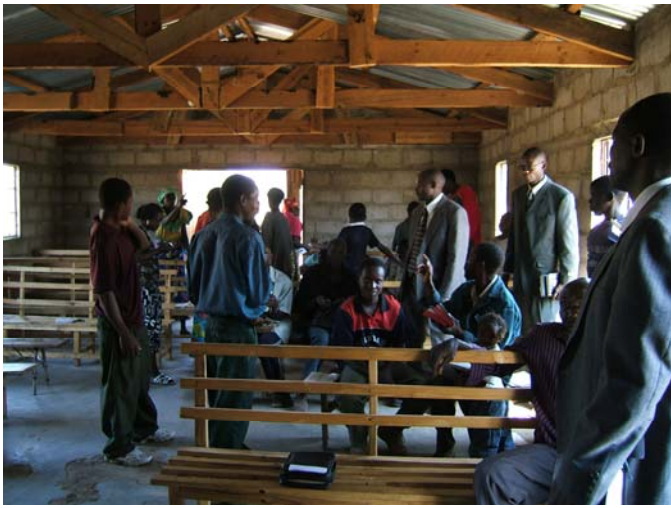
Sunday morning worship out in a village.