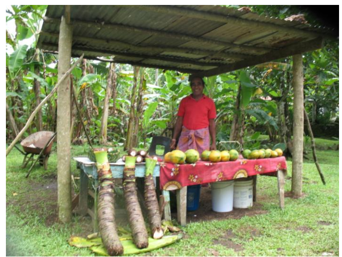
A roadside kiosk