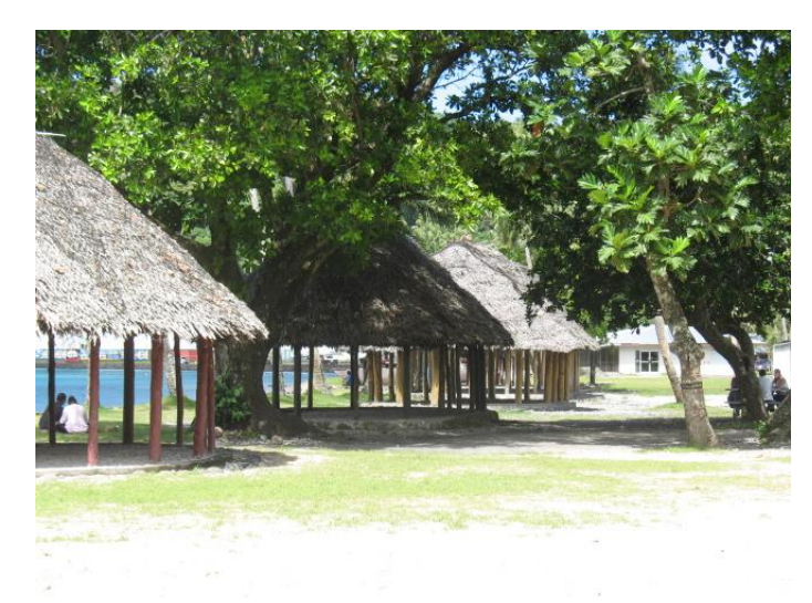
Open fales along Utelei Beach