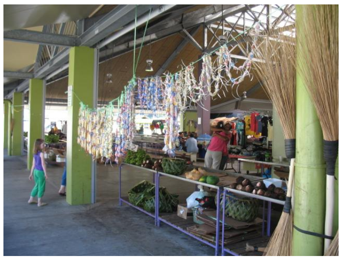
The local market