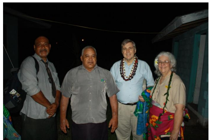
Saying "Tofa soifua" is always the hardest part of any campaign, whether you've known the friends for 20+ years . . .