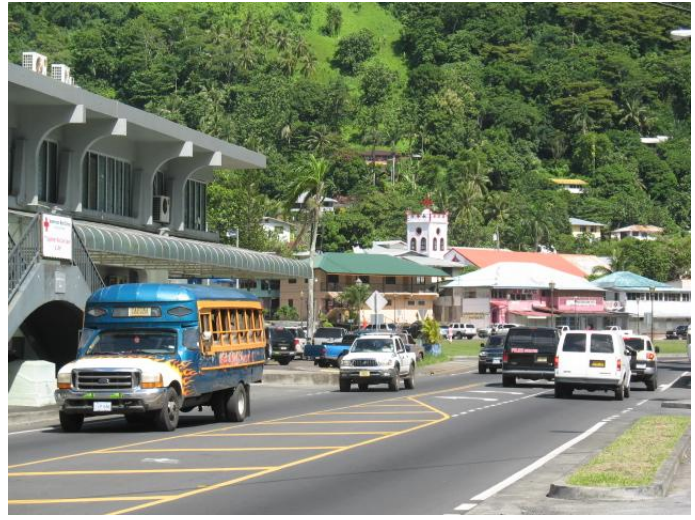
A drive into town brings more sights to share.