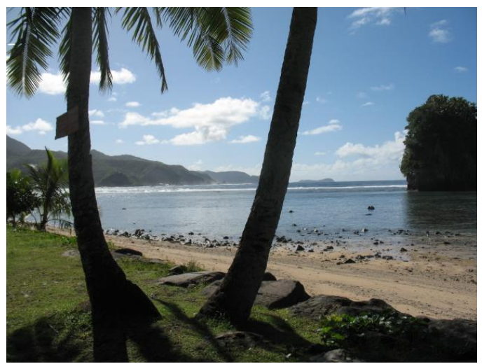
Tutuila, American Samoa