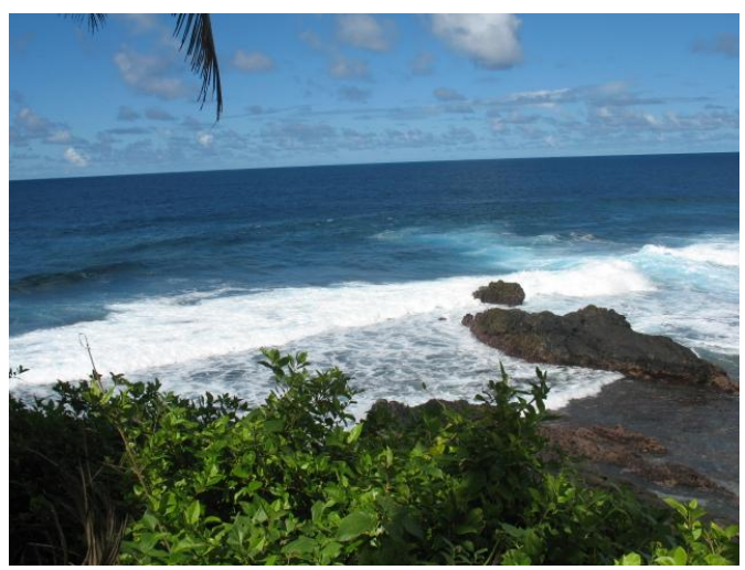
The island is small – only 19 miles long – but there are scenes of beauty everywhere you look.