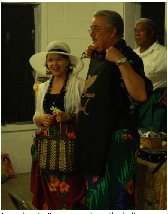
According to Samoan custom, the ladies presented gifts to us on our last night.