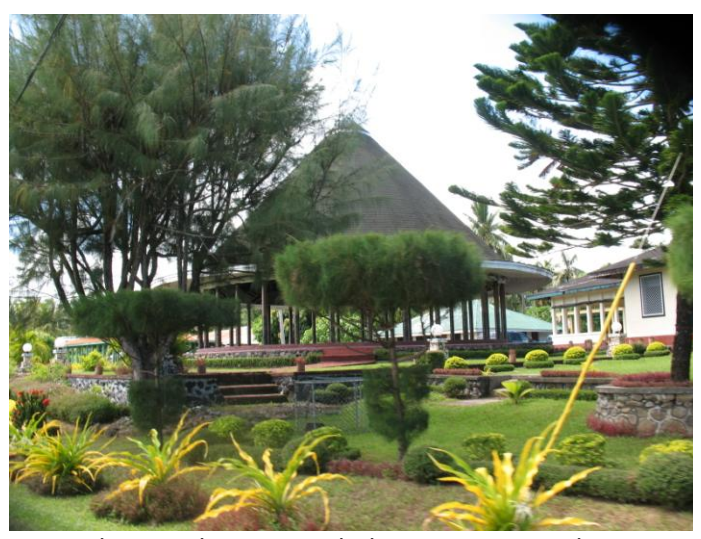
Even a drive to the store includes interesting sights.