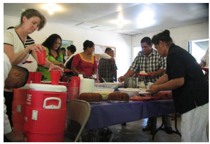
Preparing for the tonai after morning worship