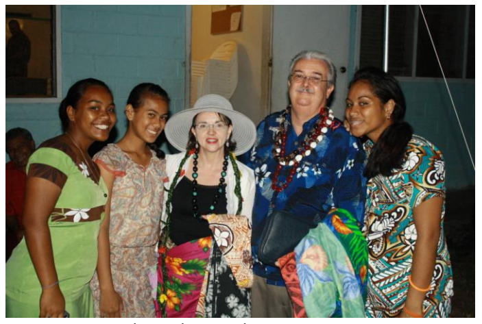
... or just met them this week.