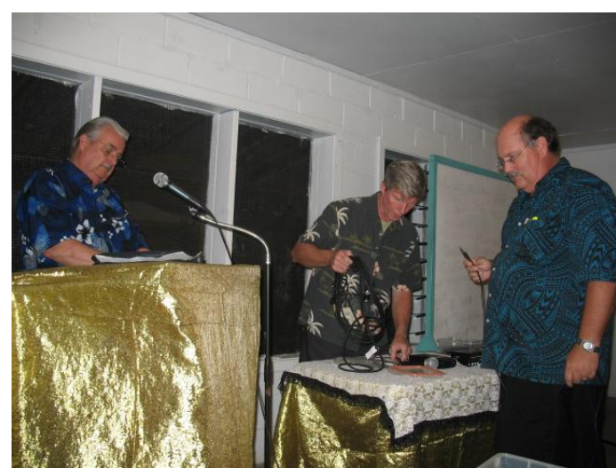
Setting up to record each night's lesson for broadcast on the radio during morning rush hour the next day